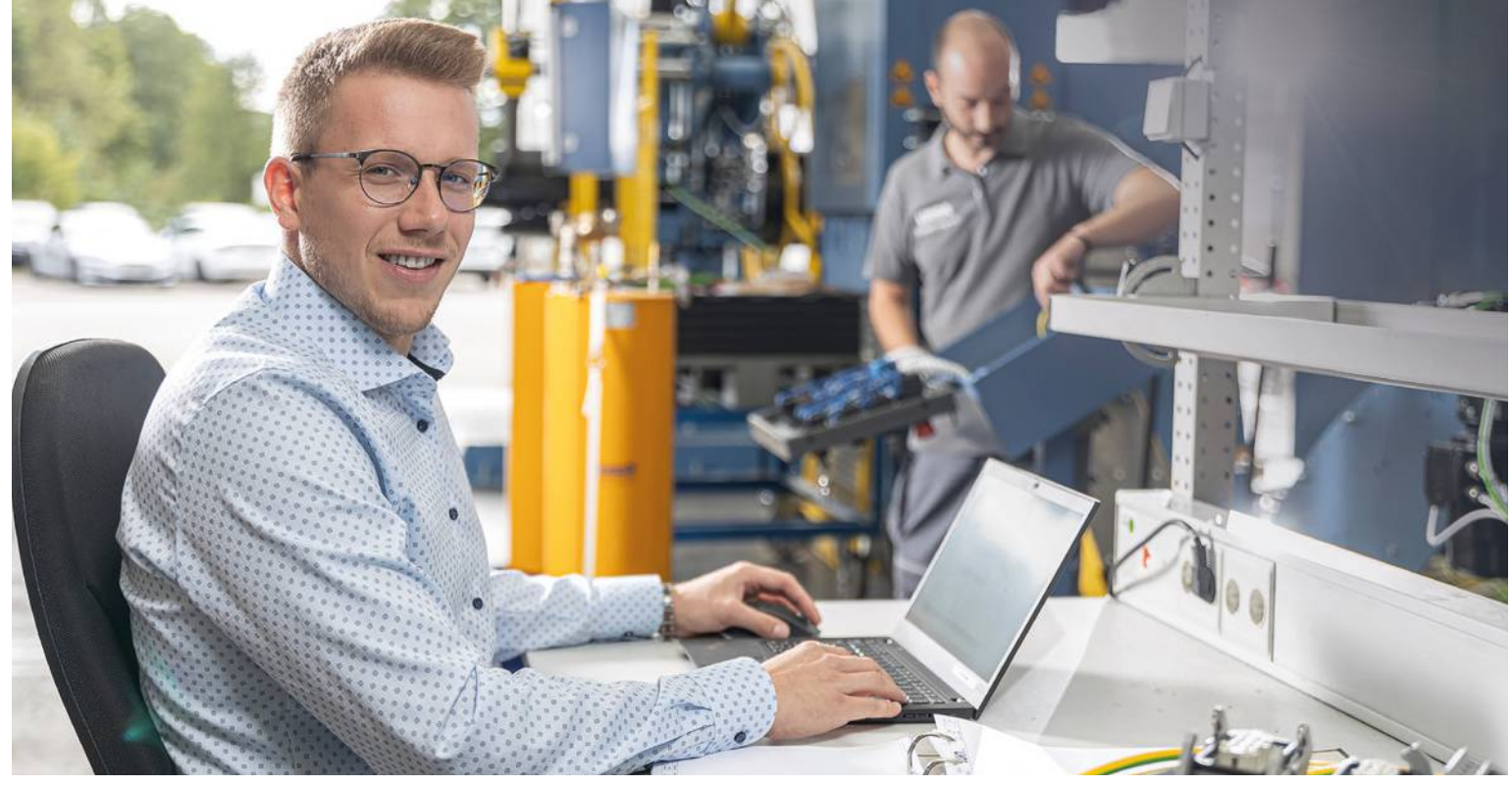
Focus on security - ARKU protects systems with state-of-the-art cyber security.

The human factor plays a decisive role here. In addition to technical measures, ARKU relies on a comprehensive training program to increase security awareness for all employees. The training