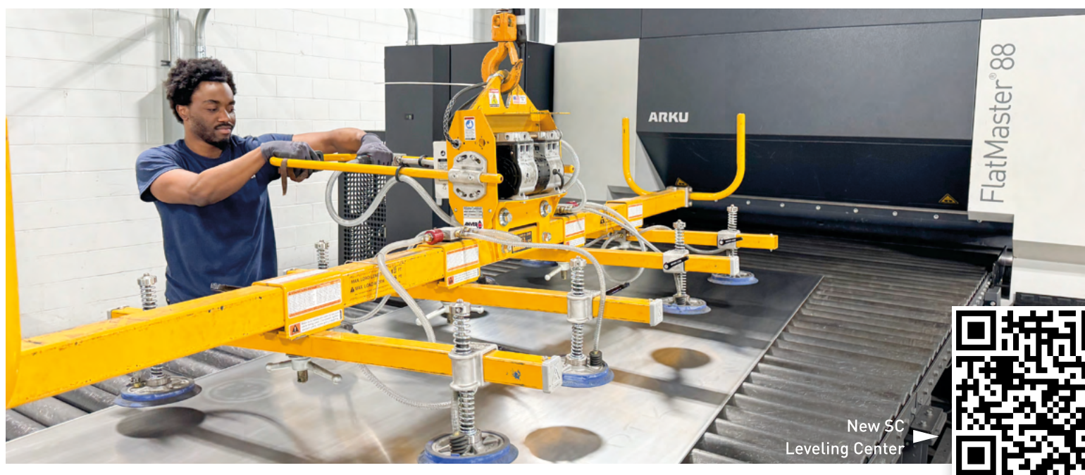
Theodore Mays is one of the machine operators for the new leveling center in South Carolina.

The facility boasts a comprehensive office space and an expansive production area with easy access for trucks. Visitors can take advantage of complimentary trial runs and seeing our machines live in action. Accessibility is a breeze, both in terms of trucks coming in from I-85, and with regard to the facility's dock and side loading/unloading capabilities.