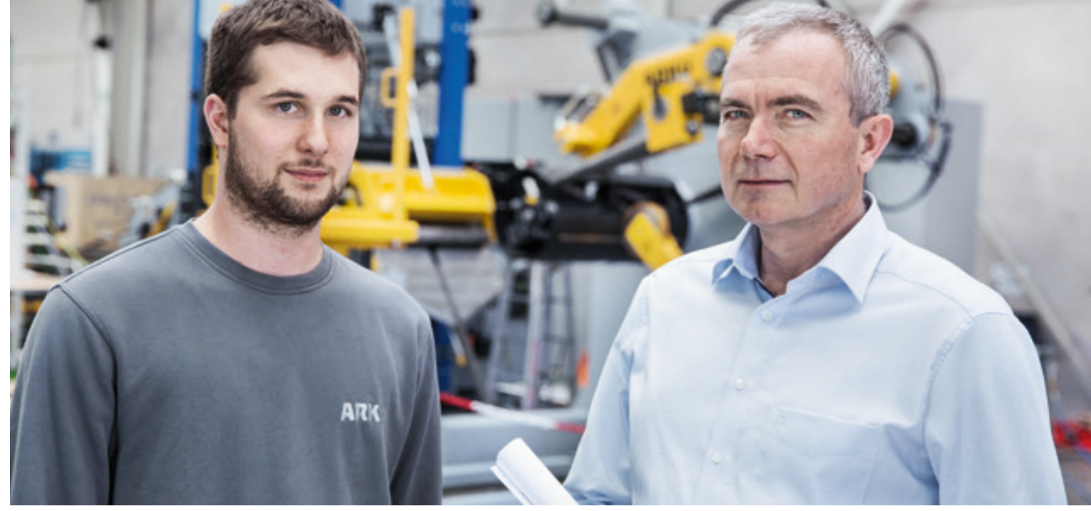
In good hands: At ARKU, customers always receive prompt service.

All around the world, of course: at its headquarters in Baden-Baden, at the subsidiaries in the USA and China, and at the sales and service partners in 30