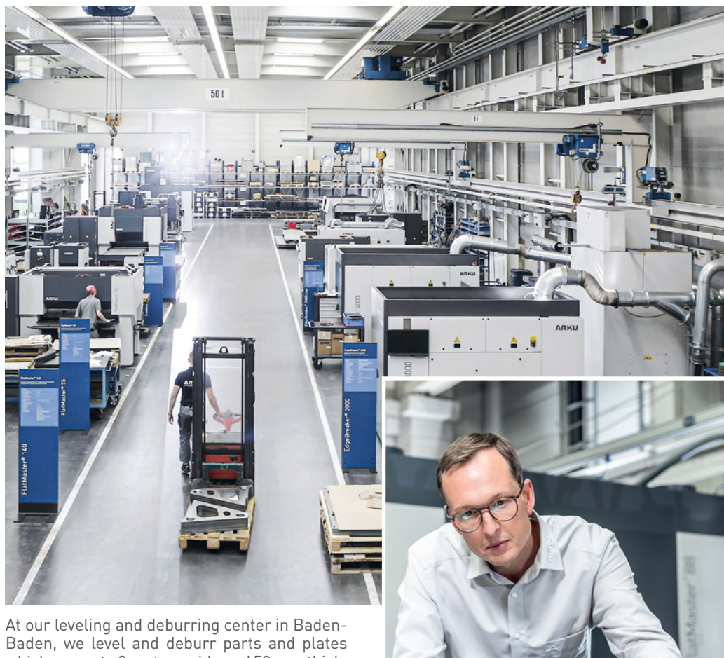
which are up to 2 meters wide and 50 mm thick.

The contract customers now come from every conceivable industry and also from great distances: The radius extends more than 500 km, including northern and eastern Germany, northern Italy, Austria, Switzerland and Alsace. "Customers choose us because our contract leveling and deburring is a unique combination, "says Enke. When