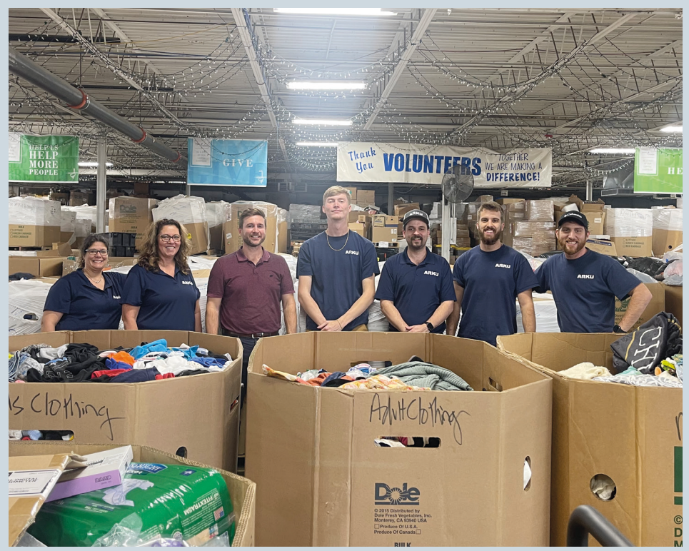
The ARKU employees are all smiles knowing that all the medical supplies they have sorted will make a huge impact for those that need it most.