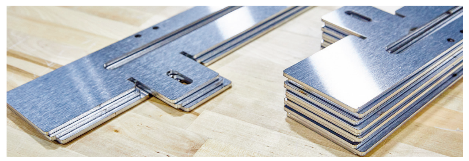
Optimal downstream processing conditions: thanks to the parts being completely burr-free, edge rounded and surface finished. All 3 processing units can be used interchangeably for complete flexibility when it comes to processing.

Besides the machine's technical features, ARKU's customer service won Robert over. "ARKU understood what we were looking for right off the bat." Project management proved equally satisfactory: in only a short period after the purchase, the machine ar-