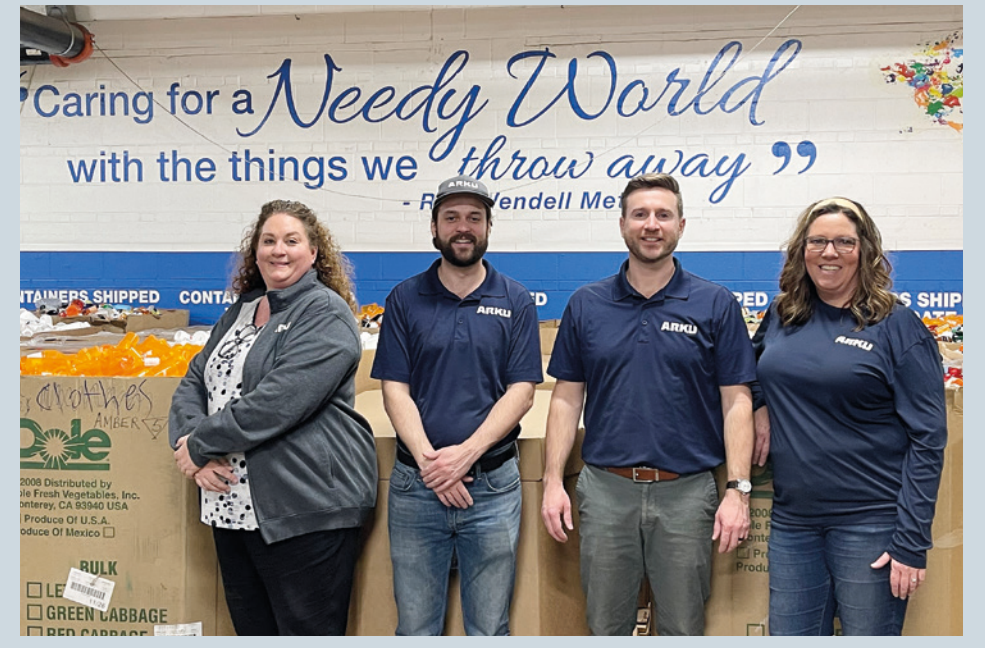
The employees from ARKU were having a great time while helping those in need.

25:34-40 of the New Testament. This is done by providing nutritional food to the hungry, clean water to the thirsty, clothing to the naked, affordable shelter to the homeless,