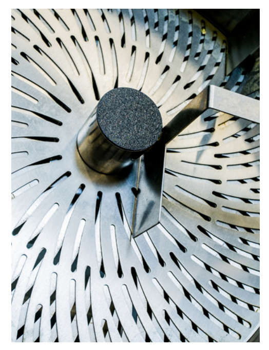
A close up of the perfectly leveled cutting blades in the final trimmer.

and affordable leveler." GreenBroz therefore decided to approach straightening via this excellent solution for sheet metal. "The test parts we sent in came back flatter than we had ever seen them before," Cullen recalls. In January 2021, ARKU installed an EcoMaster® 30-130 at GreenBroz, and it's done a wonderful job ever since, delivering flat parts that can be easily assembled. The EcoMaster® has thus helped to boost manufacturing efficiency in a rapidly growing industry.